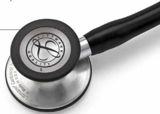
3M™ Littmann® Cardiology IV™ Stethoscopes and 3M™ Littmann® Classic III™ Stethoscopes

Designed to provide excellent sound quality over a lifetime of use, chestpieces are crafted with stainless steel and high-density zinc alloy due to their excellent acoustic properties and their strength to resist impacts, scratches and chemicals. Double-sided chestpieces have precision stems that rotate smoothly and click into position.